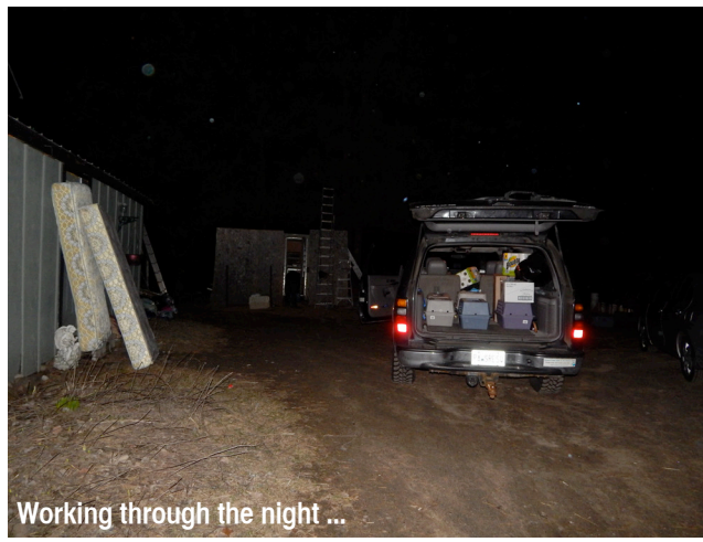
Working through the night ...