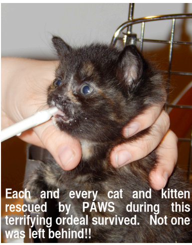
Each and every cat and kitten rescued by PAWS during this terrifying ordeal survived. Not one was left behind!!