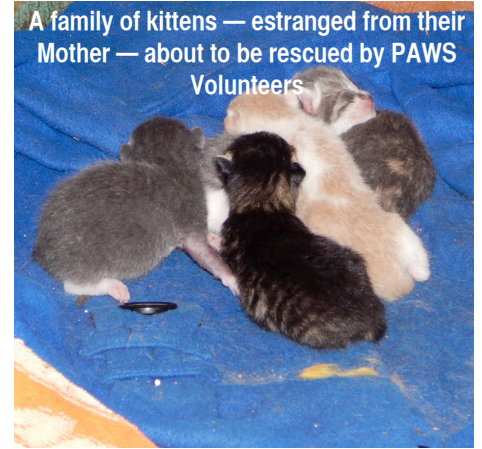
A family of kittens — estranged from their Mother — about to be rescued by PAWS Volunteers

THANK YOU PAWS SUPPORTERS! My brothers and sisters and I were so scared!