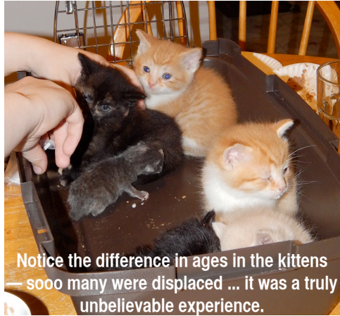
Notice the difference in ages in the kittens — sooo many were displaced ... it was a truly unbelievable experience.