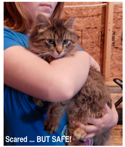
Scared ... BUT SAFE!

NINE kittens were born to this amazing Mom only a short time after she was rescued.