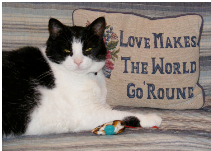
SWEETIE — A dear cat rescued by PAWS many moons ago ...